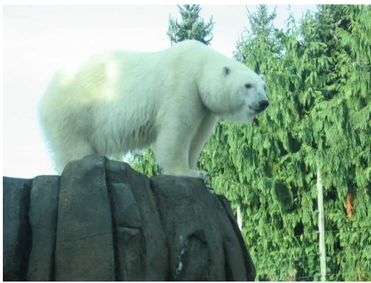
A Polarbear at Toledo Zoo

The group met at 7:45am, because we planned to go to the zoo in Toledo (in Ohio). But first we had to get there. They had a school bus for us and that's why the ride wasn't too