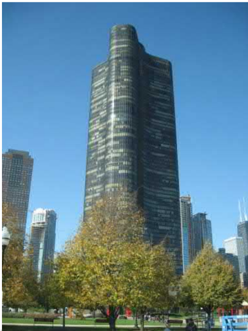
Lake Point Tower

Later we had a guided tour through a museum, but I think many people (even the Americans) were bored.