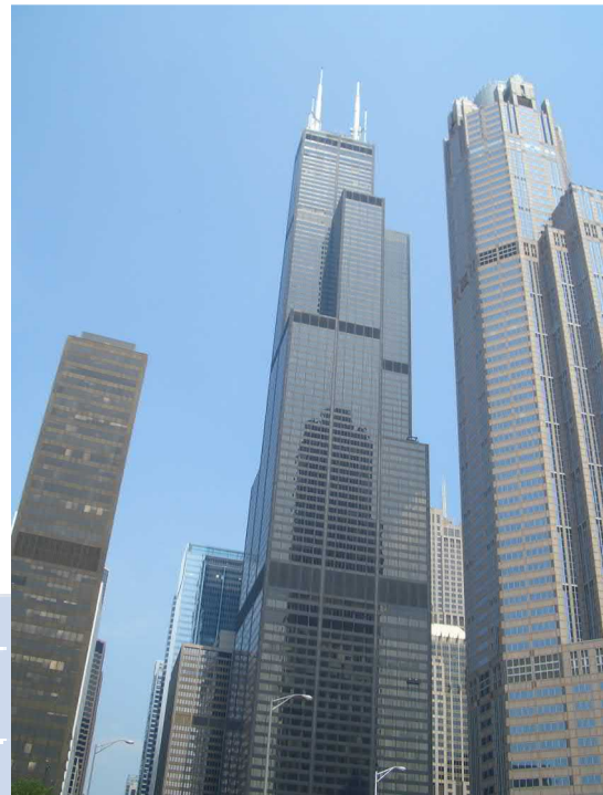
The Sears Tower in Chicago