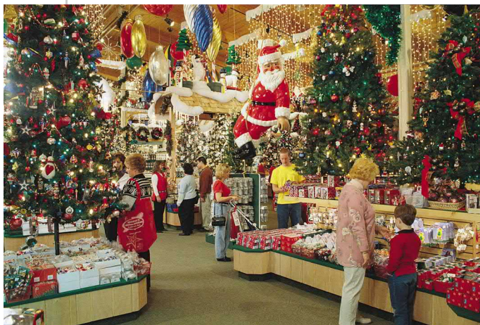
Bronner's – A (Very) Huge Christmas Store

That day I saw one of the craziest things on earth, “Frankenmuth”. It's a small village near Flint, which is trying to be German, but I think they just envision Bavarians when they think