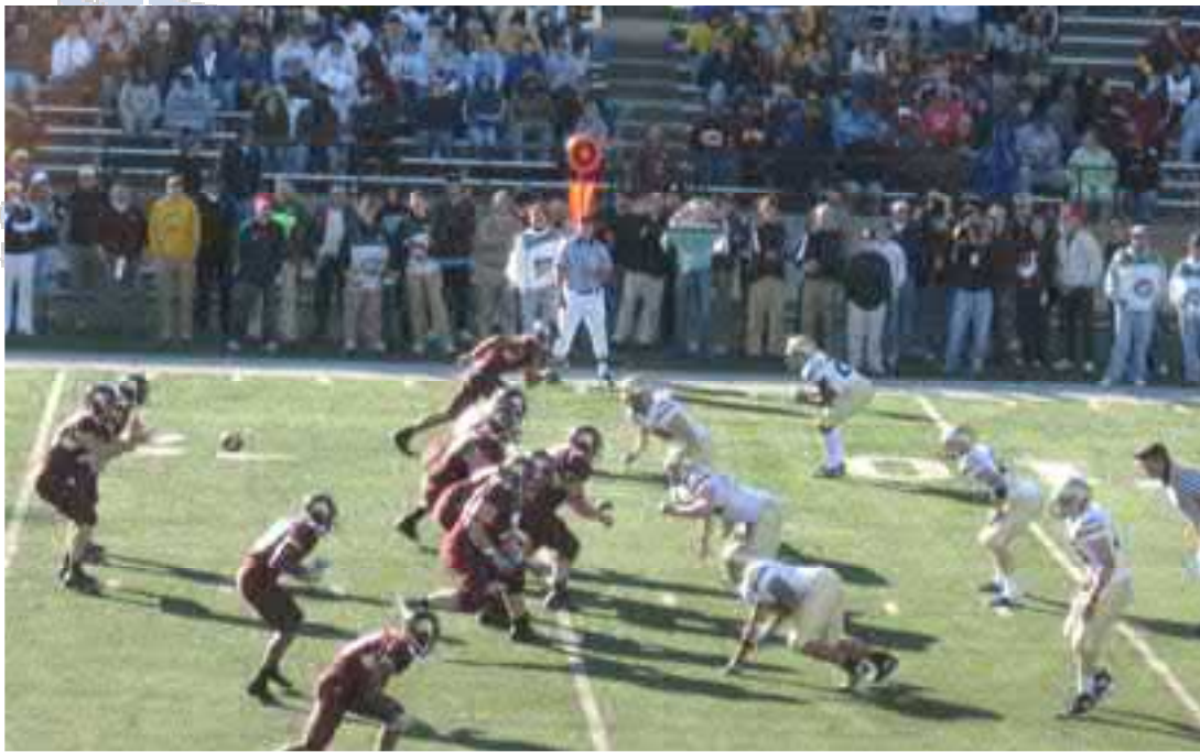
My First Football Game