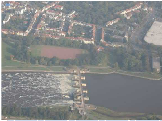
My first flight

Some minutes later we got some disgusting sandwiches. They really were. I guessed that the flavour is a mix of stinking fish, meat and dry salad