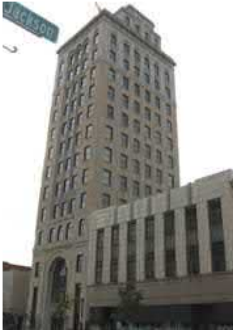
Jackson has some big buildings.