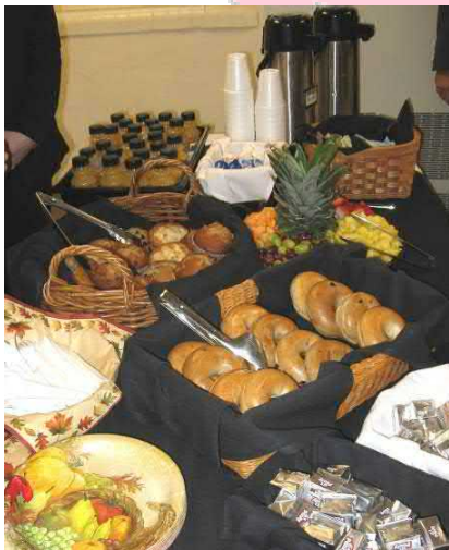
Brunch at JHS