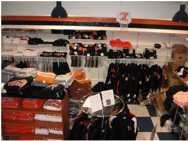
The School's Fan Shop

and other cool stuff with the school's logo there. But it wasn't shopping time ☺; we just got our ID-cards. Everyone in the school has to wear one. They took a photo of each of us and made the cards. My photo looked a kind of weird ☺!