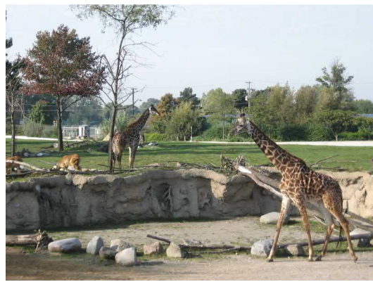
Giraffes at Toledo Zoo

comfortable. The busses are even too small for short kids like me. There were many monkeys, birds, apes and marine animals. Each of us took a lot of photos.