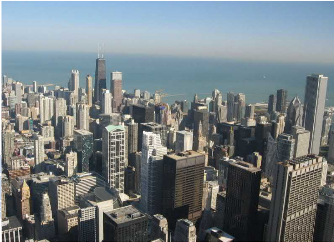
Chicago from the top

After this, we were allowed to discover the city. We entered many shops. My favourites were the Apple store and Niketown. I also tried the new iPhone. That's very cool! You can do so many things with it. After some hours we had to return to the bus ☹, because we had to go home because the journey is long. On the road it's about 335 km. We arrived at Jackson High School late at night.