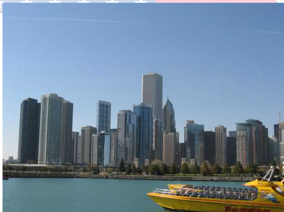
Chicago's Skyline from Navy Pier